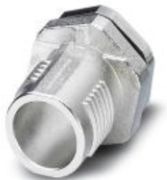
M12 SPEEDCON housing screw connection for M12 male inserts, with O-ring, for all SPEEDCON-capable THR and wave soldering contact carriers

Please be informed that the data shown in this PDF Document is generated from our Online Catalog. Please find the complete data in the user's documentation. Our General Terms of Use for Downloads are valid ( http://phoenixcontact.com/download )