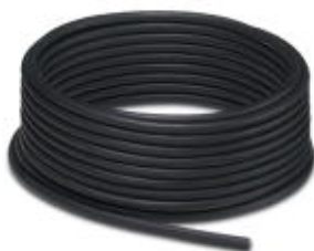
Cable ring, halogen-free PUR, black, 6-pos., conductor colors: brown / white / blue / black /gray / pink, cable length: 100 m

Please be informed that the data shown in this PDF Document is generated from our Online Catalog. Please find the complete data in the user's documentation. Our General Terms of Use for Downloads are valid ( http://phoenixcontact.com/download )