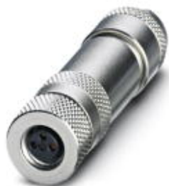
Connector, 3-position, shielded, Socket straight M8, A-coded, Screw connection, Knurl material: Nickel-plated brass, External cable diameter 3.5 mm ... 5.5 mm

Please be informed that the data shown in this PDF Document is generated from our Online Catalog. Please find the complete data in the user's documentation. Our General Terms of Use for Downloads are valid ( http://phoenixcontact.com/download )