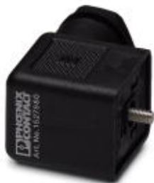
Valve connector, 3-pos., type B, unconnected, screw connection, cable screw connection Pg9

Please be informed that the data shown in this PDF Document is generated from our Online Catalog. Please find the complete data in the user's documentation. Our General Terms of Use for Downloads are valid ( http://phoenixcontact.com/download )