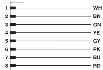
Contact assignment of the M12 plug