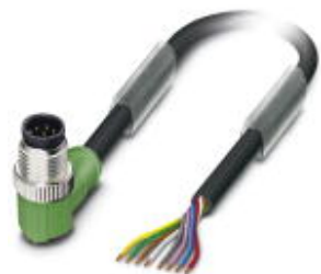
Sensor/Actuator cable, 8-position, PUR halogen-free, black-gray RAL 7021, Plug angled M12, A-coded, on free cable end, Cable length: 10 m

Please be informed that the data shown in this PDF Document is generated from our Online Catalog. Please find the complete data in the user's documentation. Our General Terms of Use for Downloads are valid ( http://phoenixcontact.com/download )