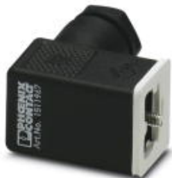
Valve connector, 4-pos., type C, unconnected, screw connection, cable screw connection Pg7

Please be informed that the data shown in this PDF Document is generated from our Online Catalog. Please find the complete data in the user's documentation. Our General Terms of Use for Downloads are valid ( http://phoenixcontact.com/download )