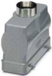
HEAVYCON B24 sleeve housing, for double locking latch, height: 76 mm, with 1 x Pg21 gland, straight cable outlet

Please be informed that the data shown in this PDF Document is generated from our Online Catalog. Please find the complete data in the user's documentation. Our General Terms of Use for Downloads are valid ( http://phoenixcontact.com/download )