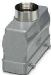
HEAVYCON B24 sleeve housing, for double locking latch, height: 65 mm, with 1 x Pg29 gland, straight cable outlet

Please be informed that the data shown in this PDF Document is generated from our Online Catalog. Please find the complete data in the user's documentation. Our General Terms of Use for Downloads are valid ( http://phoenixcontact.com/download )