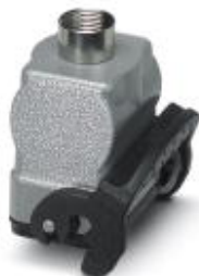
HEAVYCON B6 coupling housing, with single locking latch, height: 77.5 mm, with 1 x Pg29 gland, straight cable outlet

Please be informed that the data shown in this PDF Document is generated from our Online Catalog. Please find the complete data in the user's documentation. Our General Terms of Use for Downloads are valid ( http://phoenixcontact.com/download )