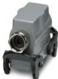
HEAVYCON B24 sleeve housing, with double locking latch, height: 72 mm, with 1 x Pg29 screw connection, lateral cable outlet

Please be informed that the data shown in this PDF Document is generated from our Online Catalog. Please find the complete data in the user's documentation. Our General Terms of Use for Downloads are valid ( http://phoenixcontact.com/download )