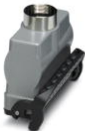
HEAVYCON B24 coupling housing, with single locking latch, height: 80.5 mm, with 1 x Pg29 gland, straight cable outlet

Please be informed that the data shown in this PDF Document is generated from our Online Catalog. Please find the complete data in the user's documentation. Our General Terms of Use for Downloads are valid ( http://phoenixcontact.com/download )