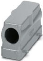
HEAVYCON B24 sleeve housing, for double locking latch, height: 65 mm, with 1 x M25 thread, lateral cable outlet

Please be informed that the data shown in this PDF Document is generated from our Online Catalog. Please find the complete data in the user's documentation. Our General Terms of Use for Downloads are valid ( http://phoenixcontact.com/download )