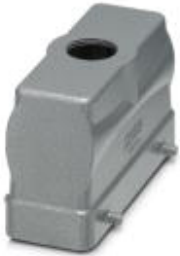
HEAVYCON B24 sleeve housing, for double locking latch, height: 65 mm, with 1 x M25 thread, straight cable outlet

Please be informed that the data shown in this PDF Document is generated from our Online Catalog. Please find the complete data in the user's documentation. Our General Terms of Use for Downloads are valid ( http://phoenixcontact.com/download )