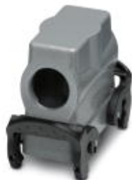
HEAVYCON B16 sleeve housing, with double locking latch, height 72 mm, with thread 1 x M32, lateral cable outlet

Please be informed that the data shown in this PDF Document is generated from our Online Catalog. Please find the complete data in the user's documentation. Our General Terms of Use for Downloads are valid ( http://phoenixcontact.com/download )