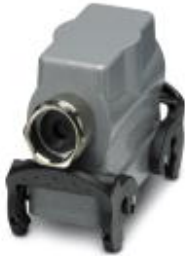
HEAVYCON B16 sleeve housing, with double locking latch, height 72 mm, with screw connection 1 x Pg29, lateral cable outlet

Please be informed that the data shown in this PDF Document is generated from our Online Catalog. Please find the complete data in the user's documentation. Our General Terms of Use for Downloads are valid ( http://phoenixcontact.com/download )