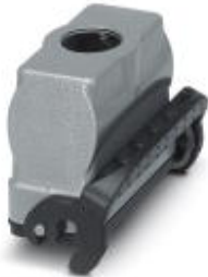
HEAVYCON B16 coupling housing, with single locking latch, height: 82 mm, with 1 x M32 thread, straight cable outlet

Please be informed that the data shown in this PDF Document is generated from our Online Catalog. Please find the complete data in the user's documentation. Our General Terms of Use for Downloads are valid ( http://phoenixcontact.com/download )