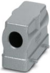
HEAVYCON B16 sleeve housing, for double locking latch, height: 76 mm, with 1 x M40 thread, lateral cable outlet

Please be informed that the data shown in this PDF Document is generated from our Online Catalog. Please find the complete data in the user's documentation. Our General Terms of Use for Downloads are valid ( http://phoenixcontact.com/download )