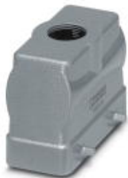
HEAVYCON B16 sleeve housing, for double locking latch, height: 76 mm, with 1 x M32 thread, straight cable outlet

Please be informed that the data shown in this PDF Document is generated from our Online Catalog. Please find the complete data in the user's documentation. Our General Terms of Use for Downloads are valid ( http://phoenixcontact.com/download )