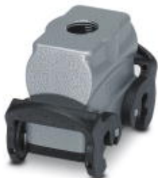
HEAVYCON B10 coupling housing, with double locking latch, height: 62 mm, with 1 x M20 thread, straight cable outlet

Please be informed that the data shown in this PDF Document is generated from our Online Catalog. Please find the complete data in the user's documentation. Our General Terms of Use for Downloads are valid ( http://phoenixcontact.com/download )