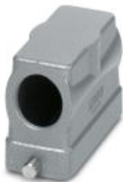
HEAVYCON B16 sleeve housing, for single locking latch, height: 76 mm, with 1 x M40 thread, lateral cable outlet

Please be informed that the data shown in this PDF Document is generated from our Online Catalog. Please find the complete data in the user's documentation. Our General Terms of Use for Downloads are valid ( http://phoenixcontact.com/download )