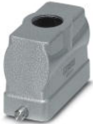
HEAVYCON B16 sleeve housing, for single locking latch, height: 76 mm, with 1 x M40 thread, straight cable outlet

Please be informed that the data shown in this PDF Document is generated from our Online Catalog. Please find the complete data in the user's documentation. Our General Terms of Use for Downloads are valid ( http://phoenixcontact.com/download )