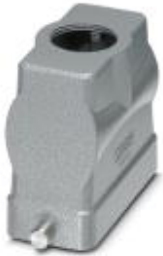
HEAVYCON B16 sleeve housing, for single locking latch, height: 76 mm, with 1 x M32 thread, straight cable outlet

Please be informed that the data shown in this PDF Document is generated from our Online Catalog. Please find the complete data in the user's documentation. Our General Terms of Use for Downloads are valid ( http://phoenixcontact.com/download )