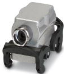
HEAVYCON B10 sleeve housing, with double locking latch, height 56 mm, with screw connection 1 x Pg16, lateral cable outlet

Please be informed that the data shown in this PDF Document is generated from our Online Catalog. Please find the complete data in the user's documentation. Our General Terms of Use for Downloads are valid ( http://phoenixcontact.com/download )