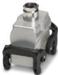
HEAVYCON B10 sleeve housing, with double locking latch, height 56 mm, with screw connection 1 x Pg16, straight cable outlet

Please be informed that the data shown in this PDF Document is generated from our Online Catalog. Please find the complete data in the user's documentation. Our General Terms of Use for Downloads are valid ( http://phoenixcontact.com/download )