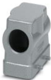
HEAVYCON B10 sleeve housing, for double locking latch, height: 72 mm, with 1 x M25 thread, lateral cable outlet

Please be informed that the data shown in this PDF Document is generated from our Online Catalog. Please find the complete data in the user's documentation. Our General Terms of Use for Downloads are valid ( http://phoenixcontact.com/download )