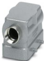
HEAVYCON B10 sleeve housing, for double locking latch, height: 56 mm, with 1 x Pg16 gland, lateral cable outlet

Please be informed that the data shown in this PDF Document is generated from our Online Catalog. Please find the complete data in the user's documentation. Our General Terms of Use for Downloads are valid ( http://phoenixcontact.com/download )