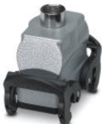
HEAVYCON B10 coupling housing, with double locking latch, height: 62 mm, with 1 x Pg16 gland, straight cable outlet

Please be informed that the data shown in this PDF Document is generated from our Online Catalog. Please find the complete data in the user's documentation. Our General Terms of Use for Downloads are valid ( http://phoenixcontact.com/download )