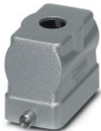
HEAVYCON B10 sleeve housing, for single locking latch, height: 56 mm, with 1 x M20 thread, straight cable outlet

Please be informed that the data shown in this PDF Document is generated from our Online Catalog. Please find the complete data in the user's documentation. Our General Terms of Use for Downloads are valid ( http://phoenixcontact.com/download )