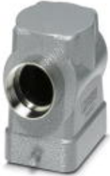
HEAVYCON B6 sleeve housing, for single locking latch, height: 72 mm, with 1 x Pg29 gland, lateral cable outlet

Please be informed that the data shown in this PDF Document is generated from our Online Catalog. Please find the complete data in the user's documentation. Our General Terms of Use for Downloads are valid ( http://phoenixcontact.com/download )