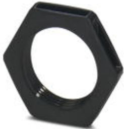
M25 nut for securing the PRC panel feed-throughs in housing, height 6.5 mm, color: black

Please be informed that the data shown in this PDF Document is generated from our Online Catalog. Please find the complete data in the user's documentation. Our General Terms of Use for Downloads are valid ( http://phoenixcontact.com/download )