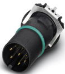
Sensor/actuator flush-type plug, 8-pos., shielded, with straight THR solder connection

Please be informed that the data shown in this PDF Document is generated from our Online Catalog. Please find the complete data in the user's documentation. Our General Terms of Use for Downloads are valid ( http://phoenixcontact.com/download )