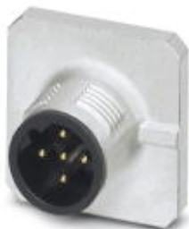
Sensor/actuator flush-type plug, 5-pos. socket, M12, B-coded, front/square flange mounting, wave soldering

Please be informed that the data shown in this PDF Document is generated from our Online Catalog. Please find the complete data in the user's documentation. Our General Terms of Use for Downloads are valid ( http://phoenixcontact.com/download )