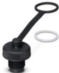
M12 sealing cap with fixing band, for free M12 sockets with 14.5 mm fastening eye

Please be informed that the data shown in this PDF Document is generated from our Online Catalog. Please find the complete data in the user's documentation. Our General Terms of Use for Downloads are valid ( http://phoenixcontact.com/download )