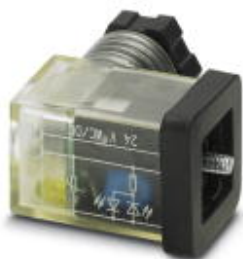
Valve connector, 3-pos., construction C, 1 LED, with protective circuit, screw connection, M12 cable gland

Please be informed that the data shown in this PDF Document is generated from our Online Catalog. Please find the complete data in the user's documentation. Our General Terms of Use for Downloads are valid ( http://phoenixcontact.com/download )