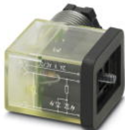
Valve connector, 3-pos., construction B, 1 LED, with protective circuit, screw connection, M16 cable gland

Please be informed that the data shown in this PDF Document is generated from our Online Catalog. Please find the complete data in the user's documentation. Our General Terms of Use for Downloads are valid ( http://phoenixcontact.com/download )