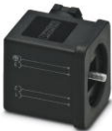
Valve connector, 4-pos., construction A, without protective circuit, screw connection, M16 cable gland

Please be informed that the data shown in this PDF Document is generated from our Online Catalog. Please find the complete data in the user's documentation. Our General Terms of Use for Downloads are valid ( http://phoenixcontact.com/download )