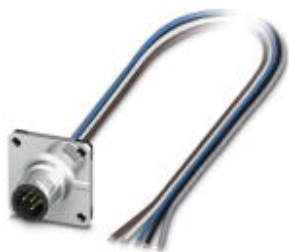
Sensor/actuator flush-type plug, 5-pos., M12, B-coded, front/square flange mounting, with 0.5 m TPE litz wire, 5 x 0.34 mm 2

Please be informed that the data shown in this PDF Document is generated from our Online Catalog. Please find the complete data in the user's documentation. Our General Terms of Use for Downloads are valid ( http://phoenixcontact.com/download )