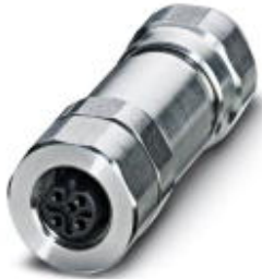
Connector, 5-position, shielded, Socket straight M12, B-coded, Screw connection, Knurl material: High-grade steel, External cable diameter 5.5 mm ... 8.6 mm

Please be informed that the data shown in this PDF Document is generated from our Online Catalog. Please find the complete data in the user's documentation. Our General Terms of Use for Downloads are valid ( http://phoenixcontact.com/download )