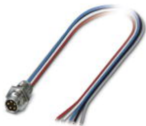
Bus system flush-type connector, plug, DeviceNet, 5-pos., M8, front/screw mounting with M8 fastening thread, with 0.5 m PVC litz wire, 5 x 0.25 mm 2

Please be informed that the data shown in this PDF Document is generated from our Online Catalog. Please find the complete data in the user's documentation. Our General Terms of Use for Downloads are valid ( http://phoenixcontact.com/download )