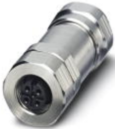
Connector, 5-position, shielded, Socket straight M12, A-coded, Screw connection, Knurl material: High-grade steel, Cable gland M16, External cable diameter 3 mm ... 5.5 mm

Please be informed that the data shown in this PDF Document is generated from our Online Catalog. Please find the complete data in the user's documentation. Our General Terms of Use for Downloads are valid ( http://phoenixcontact.com/download )