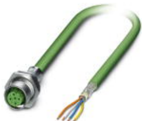
Bus system flush-type socket, PROFINET, 4-pos., M12, shielded, D-coded, SPEEDCON, rear/screw mounting with Pg9 thread, with 0.5 m bus cable, 2 x 2 x 0.34 mm 2

Please be informed that the data shown in this PDF Document is generated from our Online Catalog. Please find the complete data in the user's documentation. Our General Terms of Use for Downloads are valid ( http://phoenixcontact.com/download )