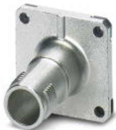
Flange housing, 25 mm x 25 mm

Please be informed that the data shown in this PDF Document is generated from our Online Catalog. Please find the complete data in the user's documentation. Our General Terms of Use for Downloads are valid ( http://phoenixcontact.com/download )