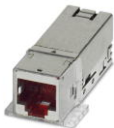
RJ45 socket insert, for Freenet-System, CAT6 A , 8-pos., shielded, with cable connection

Please be informed that the data shown in this PDF Document is generated from our Online Catalog. Please find the complete data in the user's documentation. Our General Terms of Use for Downloads are valid ( http://phoenixcontact.com/download )