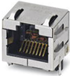
RJ45 socket insert, for PCB assembly, CAT6 A , 8-pos., shielded, with angled solder pins, 1x

Please be informed that the data shown in this PDF Document is generated from our Online Catalog. Please find the complete data in the user's documentation. Our General Terms of Use for Downloads are valid ( http://phoenixcontact.com/download )