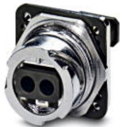
SC-RJ panel mounting frame, IP67, for bayonet interlocking, metal, with coupling for multi-mode, PCF and POF, SC-RJ on 2xSC, for round mounting cutout, with seal, without mounting screws

Please be informed that the data shown in this PDF Document is generated from our Online Catalog. Please find the complete data in the user's documentation. Our General Terms of Use for Downloads are valid ( http://phoenixcontact.com/download )