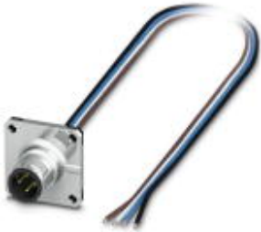
Sensor/Actuator flush-type plug, 4-pos., M12, A-coded, front/square flange mounting, with 0.5 m TPE litz wire, 4 x 0.34 mm 2

Please be informed that the data shown in this PDF Document is generated from our Online Catalog. Please find the complete data in the user's documentation. Our General Terms of Use for Downloads are valid ( http://phoenixcontact.com/download )