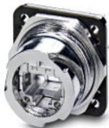
RJ45 mounting frame, IP67, for bayonet interlocking, metal, with contact insert for cable connection, for round mounting cutout, with seal, without mounting screws

Please be informed that the data shown in this PDF Document is generated from our Online Catalog. Please find the complete data in the user's documentation. Our General Terms of Use for Downloads are valid ( http://phoenixcontact.com/download )