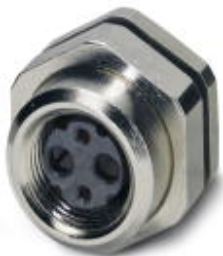
Fiber optics coupling M12, duplex, suitable for all fibers, with wall bracket, IP65 degree of protection

Please be informed that the data shown in this PDF Document is generated from our Online Catalog. Please find the complete data in the user's documentation. Our General Terms of Use for Downloads are valid ( http://phoenixcontact.com/download )