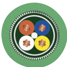
PROFINET drag chain CAT5 [93C]