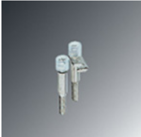
Switching bridge, 2-pos.

Please be informed that the data shown in this PDF Document is generated from our Online Catalog. Please find the complete data in the user's documentation. Our General Terms of Use for Downloads are valid ( http://phoenixcontact.com/download )